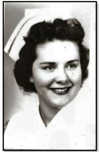
First Nurse Uniform, 1957