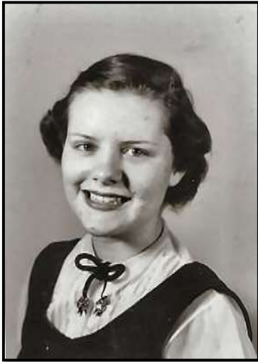
High School Freshman 1953