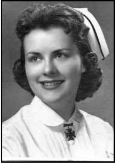
Registered Nurse Graduation 1960